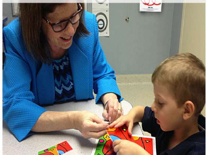
Kids love playing with PuzzleArt™ in over 50 countries, in museums, galleries, and public art spaces worldwide